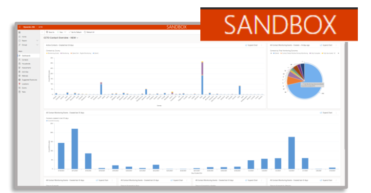
Sandbox/UAT always displays the "Sandbox" sticker, while Prod does not. Remember that only Sandbox should be used for practice.

Prod (or "Production") is the live system for entry of real contact information protected by HIPAA, and it should never be used for testing.